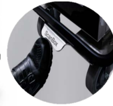
includes central brake